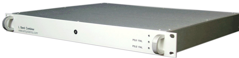
Front View of Model C0801S1ULA-22242-N5N5

with dual redundant amplifiers and internal 10 MHz source